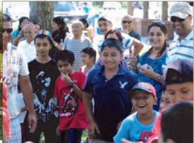
Below: Folks of all ages enjoying the NNS Picnic