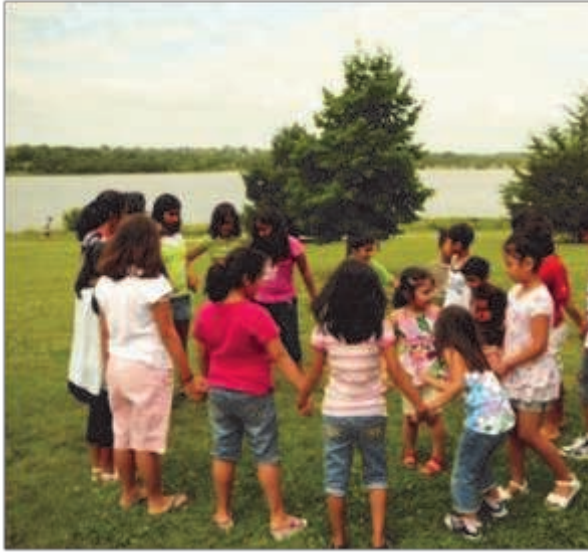
Above: Bal Karyakram participants playing at park